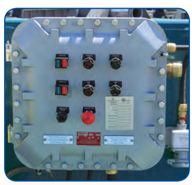
Control Panels Shown in Various Configutations